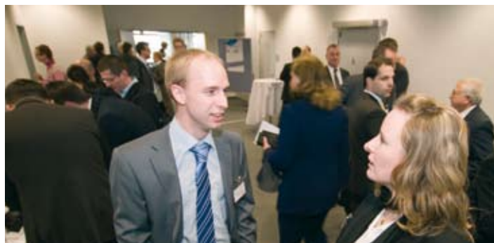
Impression from 2nd European Networking Event, March 2010